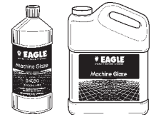
04050 Machine Glaze