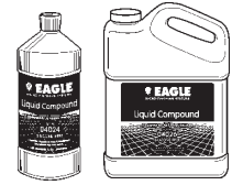
04024 Liquid Compound