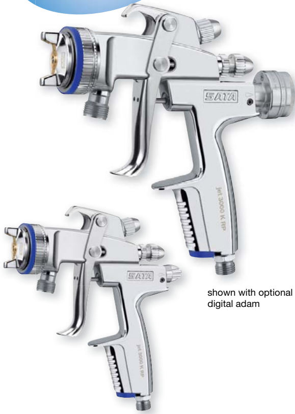
shown with optional digital adam

The SATAjet 3000 K RP features nickel-plating, variable fan control, fluid adjustment and built-in air micrometer. The 3000 K has a light trigger pull and self-adjusting Teflon seals. Patented features include CCS (Color Code System) with colored discs for easy gun recognition and QC (Quick Change) air cap with only 1½ turns.