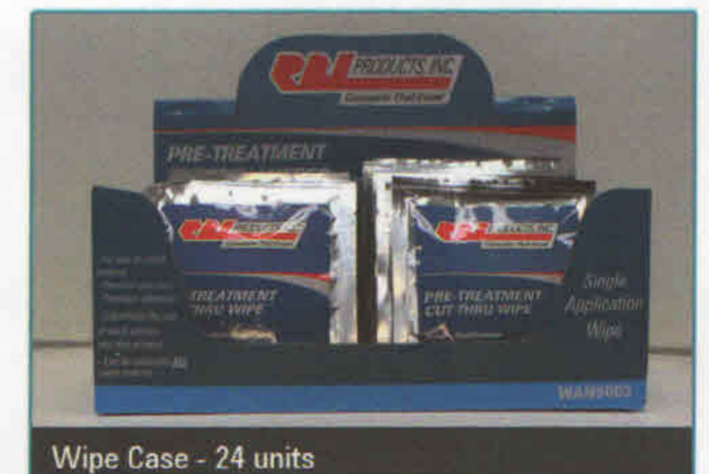
Wipe Case - 24 units