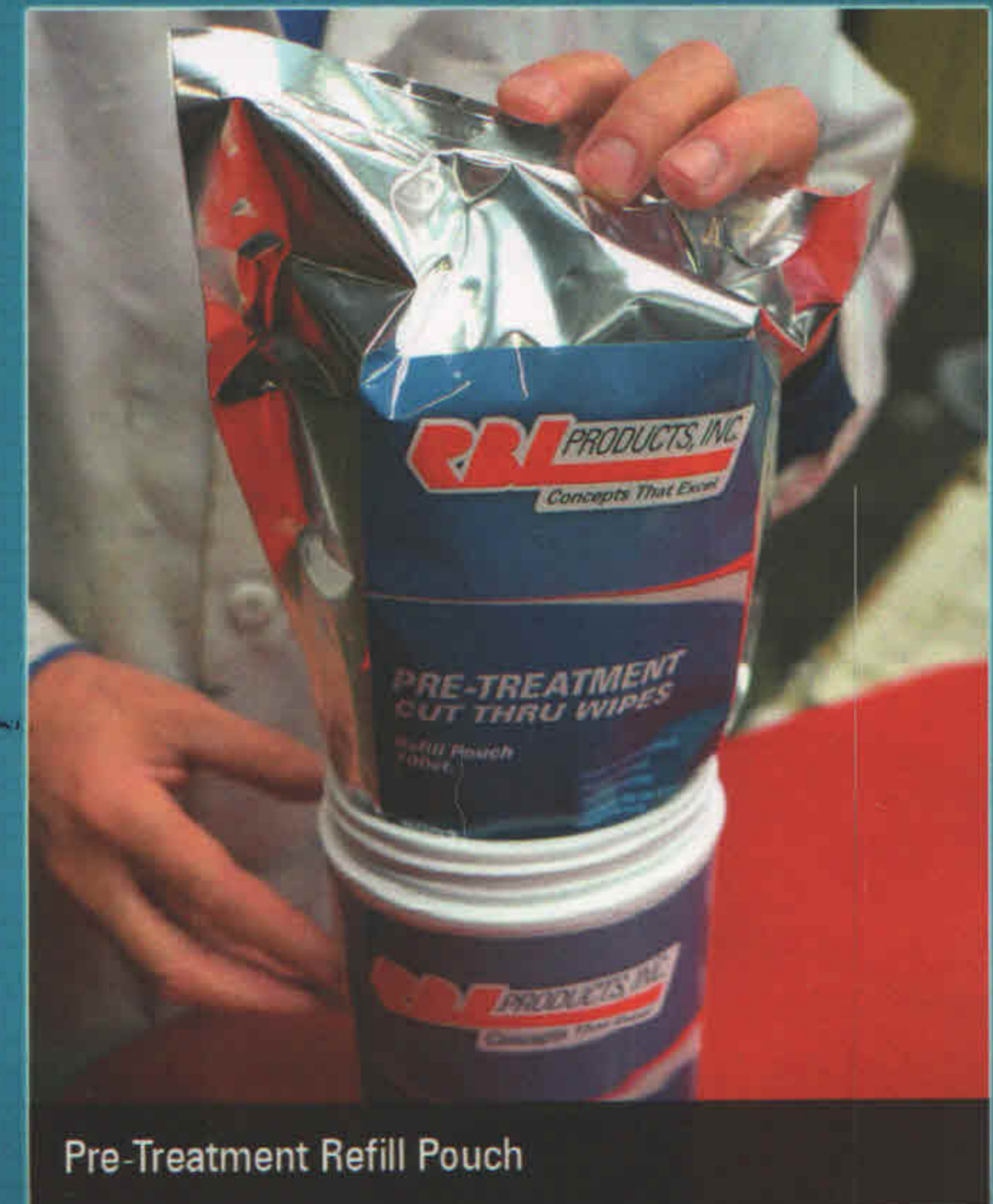
Pre-Treatment Refill Pouch

Applications: Steel, Stainless Steel, Galvanized Steel, Aluminum