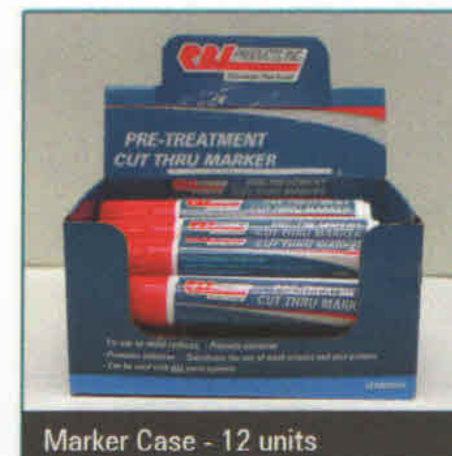
Marker Case - 12 units