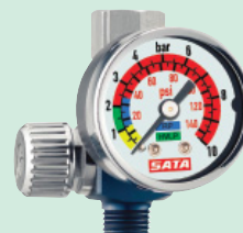
SATA air micrometer with gauge No. 27771