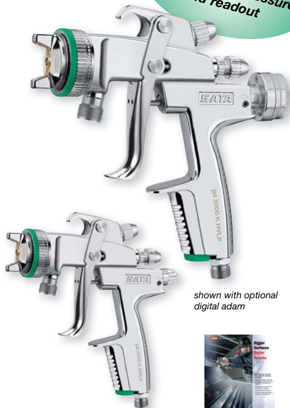
shown with optional digital adam

Exclusive SATA adam to set DIGITAL inlet pressure and readout