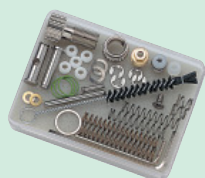
Repair Kit SATAjet 3000 K No. 92767

**Special treated nozzle sets are extremely resistant to wear and tear from abrasive material.